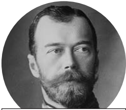
Nicholas II of Russia

Chekhov was much admired by Rachmaninoff and even served as inspiration for Sergei's 1893 composition Der Fels (The Rock) .