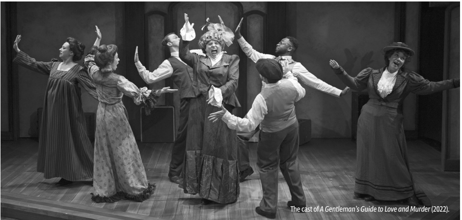
The cast of A Gentleman's Guide to Love and Murder (2022).